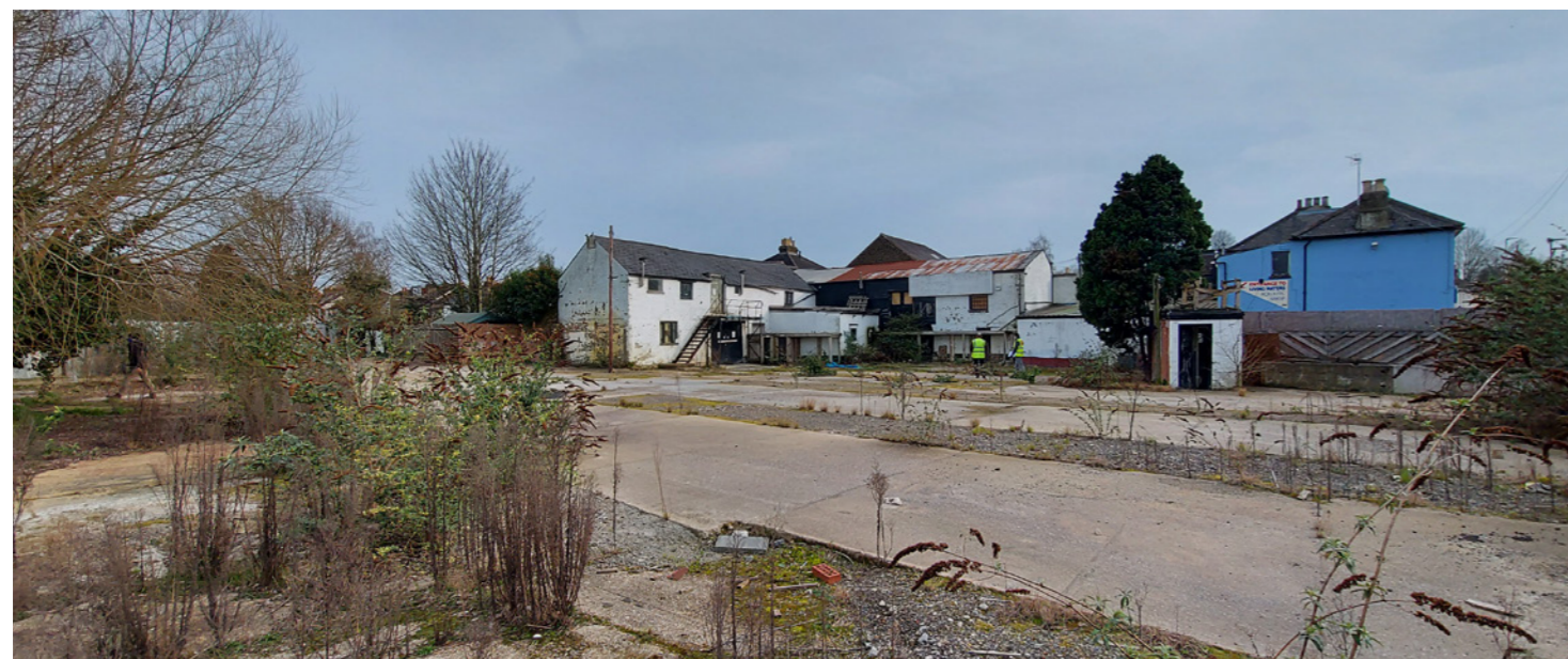
View from North-west Corner of Site

The site lies towards the northern edge of the Beddington Village Conservation Area and sits between a largely residential area to the south and allotments to the north. Beddington Lane and the conservation area are characterised by two-storey buildings with pitched roofs.