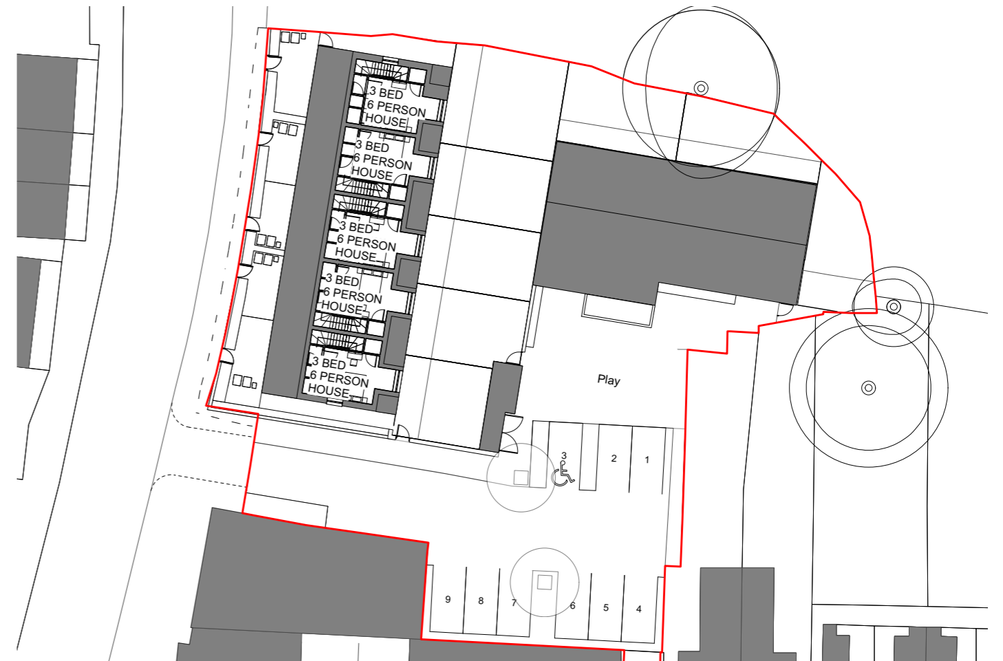
Proposed Second Floor Plan