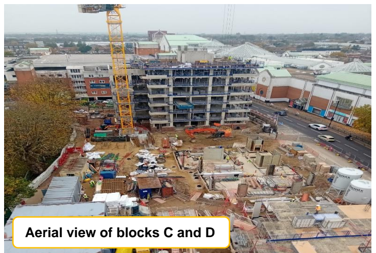
Aerial view of blocks C and D

The substation brickwork is now complete.