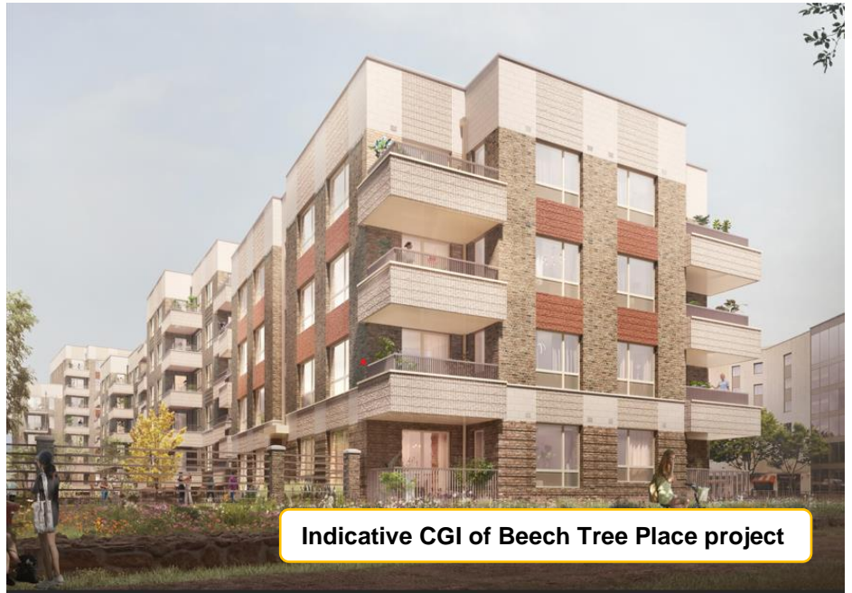
Indicative CGI of Beech Tree Place project

This month we are welcoming 90, Year 3 Students from Robin Hood Primary School to take part in some construction activities.